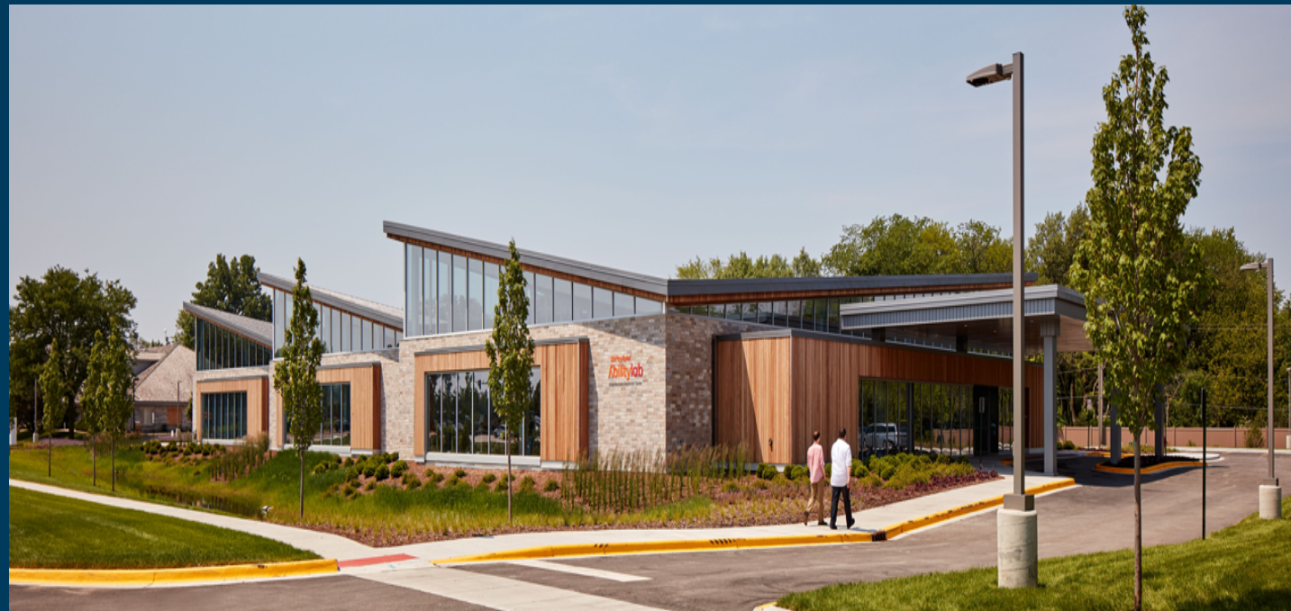
Shirley Ryan Ability Lab